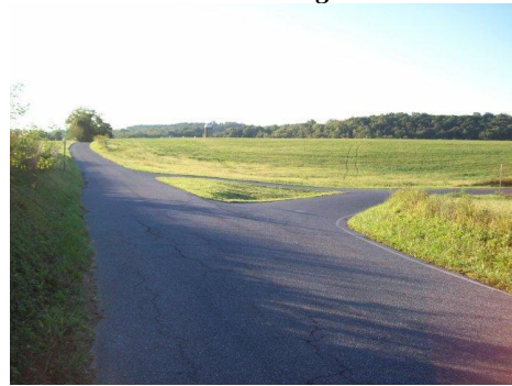
Dead End Road –Bear Right!