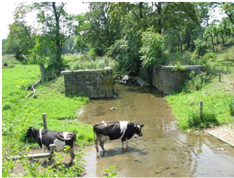
Canal Lock on Emma Road

In less than two miles from your start, the route passes by Hill United Church of Christ which was constructed with stone taken from canal locks, and in less than 3 miles the route passes by a canal lock on a farm that participates in the county's agricultural preservation program. Preserving the past and the future is valued in Lebanon County.