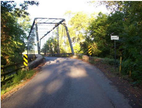
Bridge over Little Swatara Creek