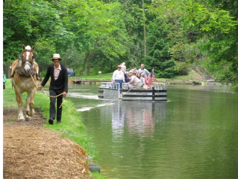
Celebrating Union Canal Days in May

This scenic ride provides opportunities to learn about the Union Canal and cycle beside and over the Swatara and Little Swatara Creeks that provided their waters for the Canal. By starting at Union Canal Tunnel Park, you can visit the park and, perhaps, enjoy a canal boat ride (specific Sundays). The annual Union Canal Days are held the third weekend in May. For more information: http://www.lebanonhistory.org/ .