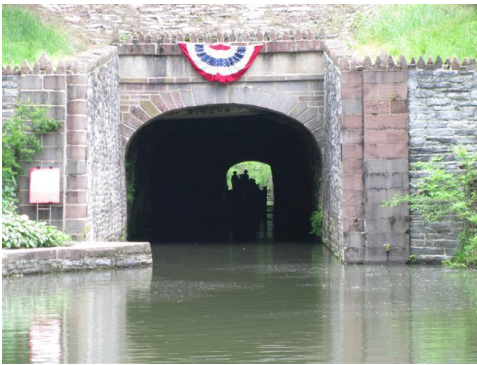
South Portal of Union Canal Tunnel

In 1792, construction of a canal using the Tulpehocken and Swatara Creeks to connect the Schuylkill River at Reading and the Susquehanna River at Middletown was undertaken. Five locks were constructed between Myerstown and Lebanon, but financial difficulties ended this first endeavor. In 1811, the Union Canal Company of Pennsylvania was organized; ultimately a canal with 102 locks over 80 miles was completed in 1828. A north branch was completed in 1832 from Water Works to Pine Grove to reach the coal fields. Construction of the Tunnel, by hand drilling and blasting with gunpowder, lasted two years, 1825-1827. This achievement connected the eastern and western branches. The Union Canal Tunnel is the oldest existing transportation tunnel in the country. The Canal ceased operation in 1885 due to several factors - a flood that caused considerable damage, insufficient water supply, costly widening of the locks, and ultimately, railroad competition.