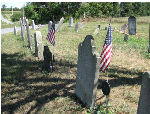
Cemetery on Light's Church Road

Rural churches, cemeteries, productive farms and orchards as well as frequent encounters with "the Swatties" - Swatara Creek and Little Swatara Creek - will round out your experiences on this ride.