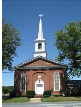
Zoar Evangelical Lutheran Church