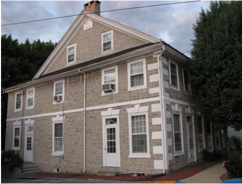
Wolf Tavern which is a private home today

Tavern (1796), Buck Hotel (1804), and the Heilman Hotel (rebuilt in 1862 after a fire) are three remaining structures that reflect the significance of past centuries' traffic and trade.